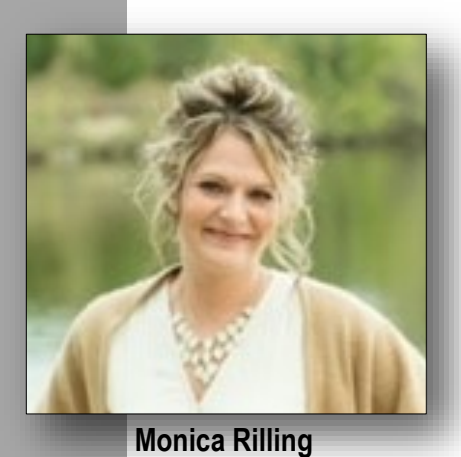
Co-Chair of Membership Committee