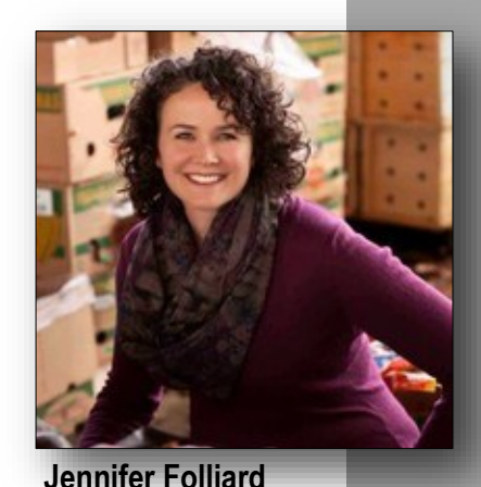
Chair of Policy Committee

While we don't vote on committee chair positions, we want to thank and acknowledge these women for volunteering their time in their respective positions in the 2020-2021 year.