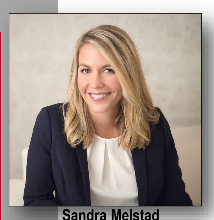
Immediate Past President

While we don't vote on committee chair positions, we want to thank and acknowledge these women for volunteering their time in their respective positions in the 2020-2021 year.